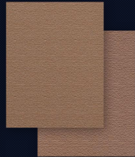
SAMPLE B Penetration with SPC