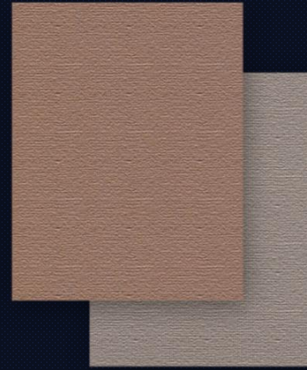
SAMPLE A Penetration without SPC