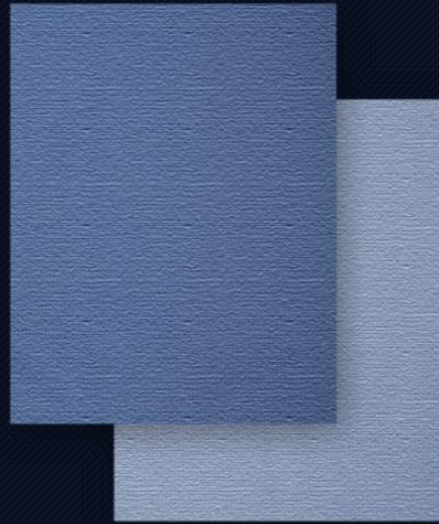
SAMPLE A Penetration without SPC