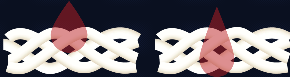
PENETRATION WITHOUT SPC

SPC is designed to enable homogeneous color penetration into fabrics in direct-to-textile printing by utilizing several complementary elements.