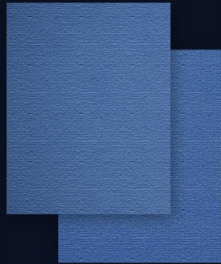
SAMPLE B Penetration with SPC